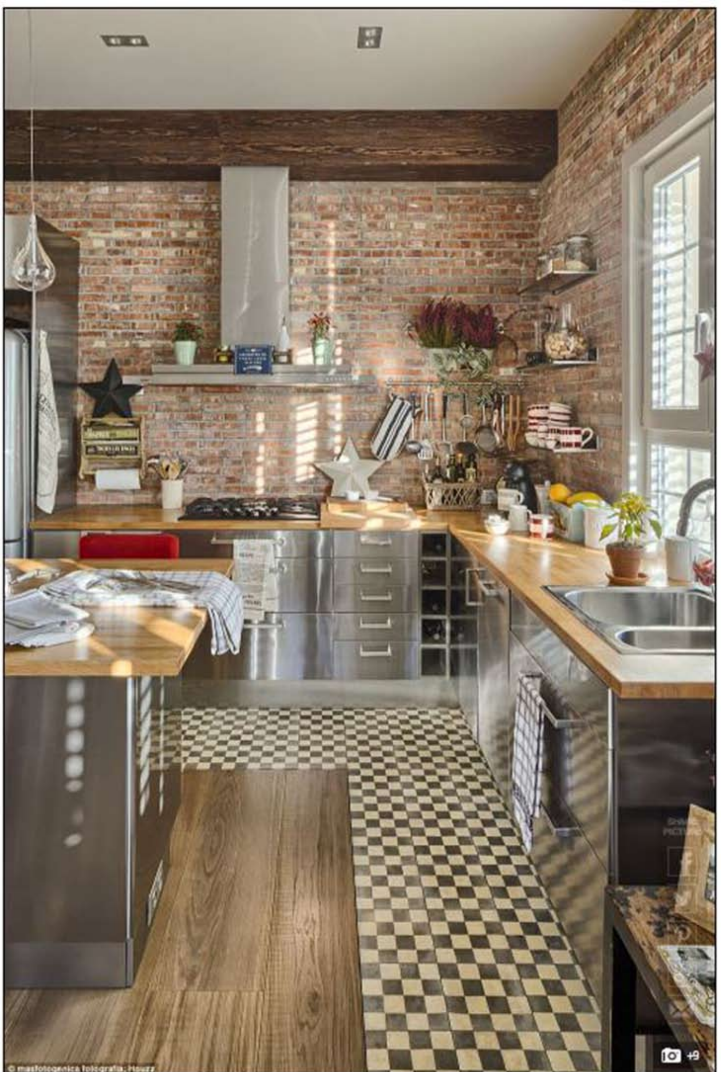
Classic: Found in Aravaca, Madrid, this kitchen was redesigned five years ago as part of a whole home renovation project but still remains one of the most popular kitchen photos on Houzz globally. The homeowners are a young married couple who own and work in their restaurant. The countertop of the wood island was designed to slide so they can use it as a working table or as a dining table with high stools for eating (cost of project not available)